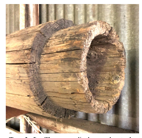
Top Left: The new display rack at the Garage, courtesy of Jay and Fred; Above: The male end of a water pipe, manufactured to fit, probably with the help of tar and wire or a metal band, into the female end.