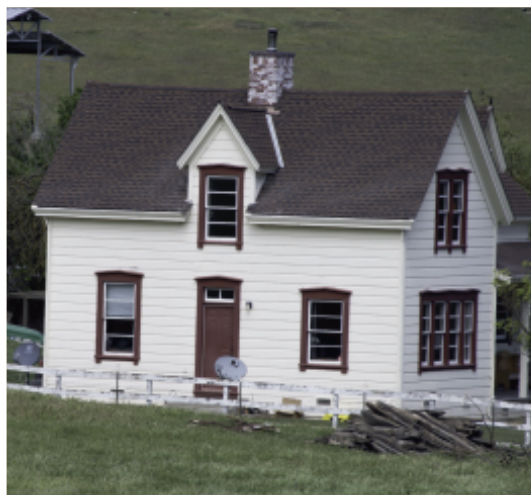
The Young family home at 11761 North Flynn Road was a terminal point of the Altamont Barbed Wire Telephone.

Young's article says that the barbed wire telephone was in use until circa 1915, when a phone connection was made with the Livermore exchange.