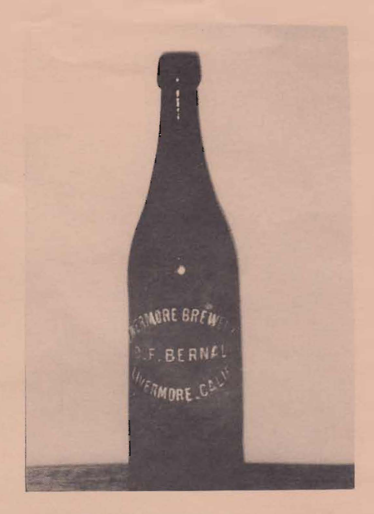
Bottle from Livermore Brewery

Final Note: Amber beer bottles embossed with "Livermore Brewery - D.F. Bernal - Livermore, Calif." exist today. These bottles are very rare. Less than two dozen are known. These were probably made just before the fire, with most being destroyed in the fire.