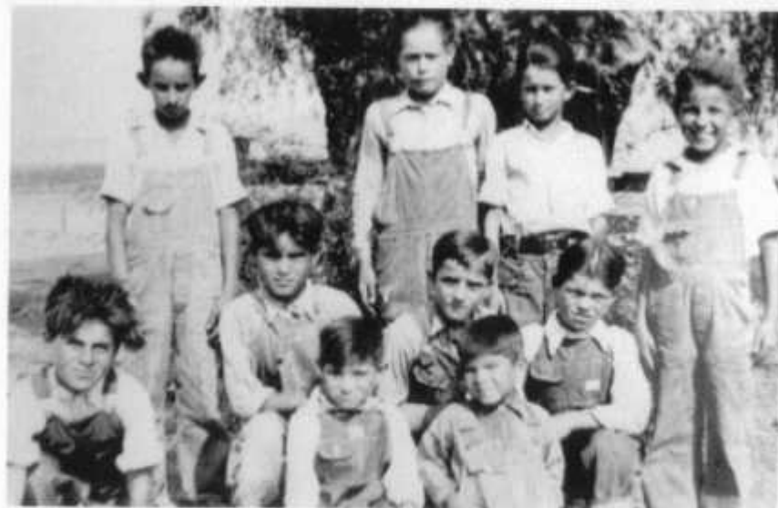
MIDWAY SCHOOL PHOTOS