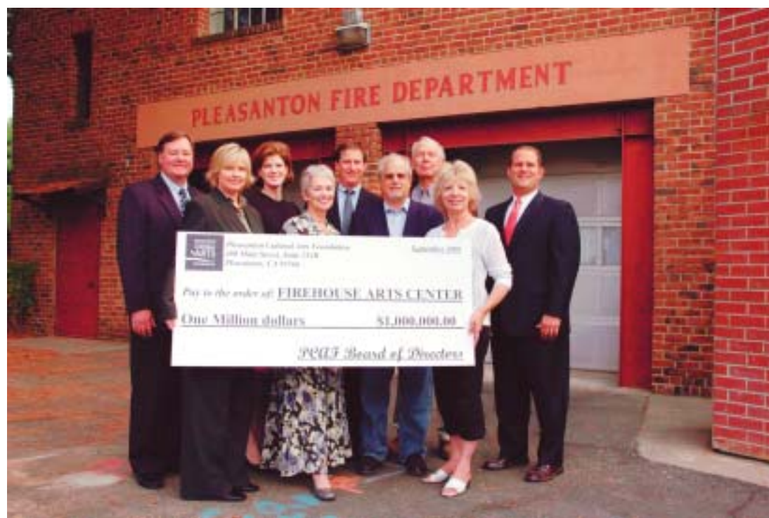
The Pleasanton Cultural Arts Foundation Board holds a check for $1 million, the amount they plan to give towards construction of the Firehouse Arts Center.

It is expected that the center, slated to open in early 2008, will become a focal point that will stimulate the economic growth and cultural vitality of the downtown core. It will capitalize on