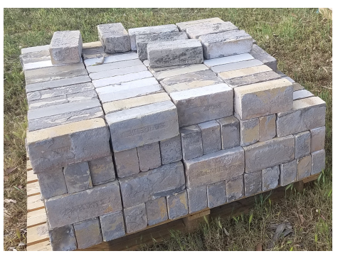
Top: Even pumping water turns into a game at Hagemann Ranch; Above: Yellow Carnegie bricks stacked on pallets, ready for the walkways; Left: Two types of spinners at the Vintage Crafts and Toys event, with some beautiful quilts displayed behind them on the fence.