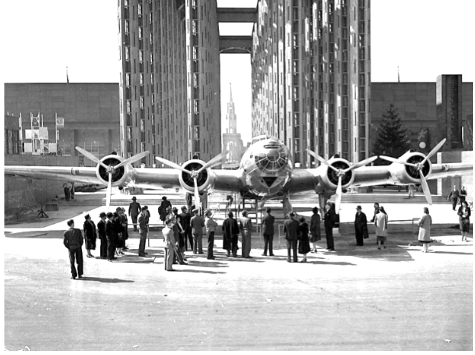
Top left: The photo that started the search. Photo courtesy Jay Morris family; Left: Treasure Island was originally envisioned as the airport for San Fransisco. This highly inaccurate 1932 rendering of the proposed airport shows the Ferry Terminal and Yerba Buena Island before the San Francisco – Oakland Bay Bridge was built (completed in 1936). (Tim Tyler); Right: This photo from the archives of the San Francisco Chronicle answered several questions. This is the prototype Boeing YB-17; the location is behind the Federal Building at the 1939 Golden Gate International Exposition on Treasure Island. However, it raised another question: How did this YB-17 get on Treasure Island? The Tower of the Sun and the Court of Reflection Arch in the background, framed by the columns of the Federal Building. (unknown/SF Chronicle)