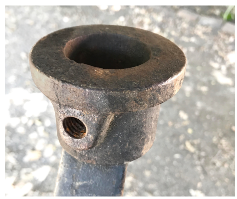
Far above: The mystery object. Above: the threaded hole in detail.

We received three banker boxes of donations for Hagemann Ranch consisting of blacksmith shop tools, household appliances, garden tools and bottles. It's a great local collection and we were lucky to have the mothers and daughters of the National Charity League come out and help us with cataloging. Most of the items we were able to identify, from the cabbage mandoline to the hand crank apple peeler, but this thing emerged from the box and we all ALMOST knew what it was for. It clamps to a table or bench, isn't decorative, and clearly it is built to withstand a lot of force. The mount at the top is not generic but clearly carefully sized to fit a, well, darn, we are not quite sure. There's a threaded hole for a set screw or tightening knob to hold the, ...thing. Have you seen one of these? Where did you see it? Any idea what goes in that mount?