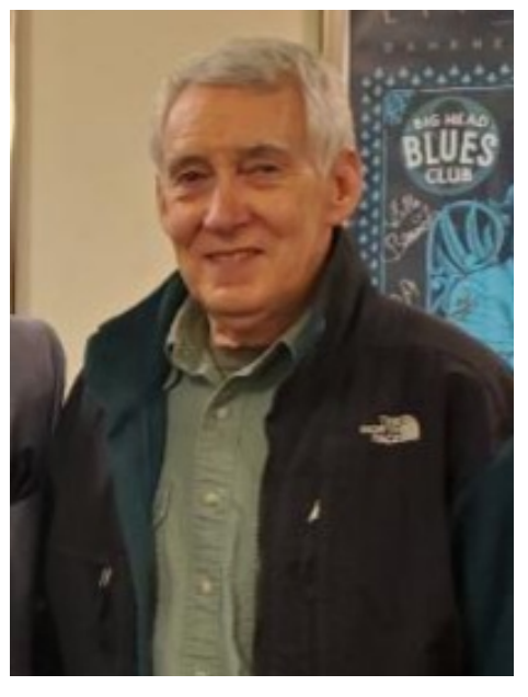
Above