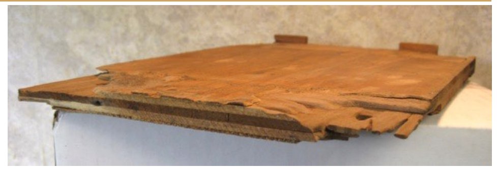
Left: The original chassis with tubes, resistors, capacitors, and wires, as well as the original speaker, still intact. But the original plywood base ( above ) suffered significant insect and water damage.

The fourth element of the story: While I didn't particularly want the radio to play contemporary AM radio, I did think it would be fun to have it play 1930s radio. To accomplish that, Fred Deadrick found an MP3 player on a small circuit board that has several types of interface connections, a microSD card, and an output that will drive a small speaker. I mounted all of these components on a sound board that attaches to the back of the radio using existing features on the radio. With a twist of two quarter-turn latches, the MP3 sound board lifts off the radio, returning it to its original