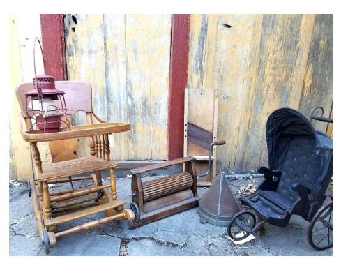
Above: A sample of antiques found in the Pie Room.

Each item in storage was brought out into the daylight and dusted off so we could read any labels. Some were easily identified but others were real mysteries. The art of researching antiques online was quickly mastered by all. After being identified, each item received a tag, an accession number and had its picture taken. All this will be recorded in our software program at the History Center. To further organize the more than fifty treasures, we sorted them according to where they may eventually be displayed. The ice cream maker and butter churn will go in the Milk House. The table top clothes wringer and washboard will go in the Wash House and all the kitchen utensils will find a home in the house kitchen. Some of the canning jars and