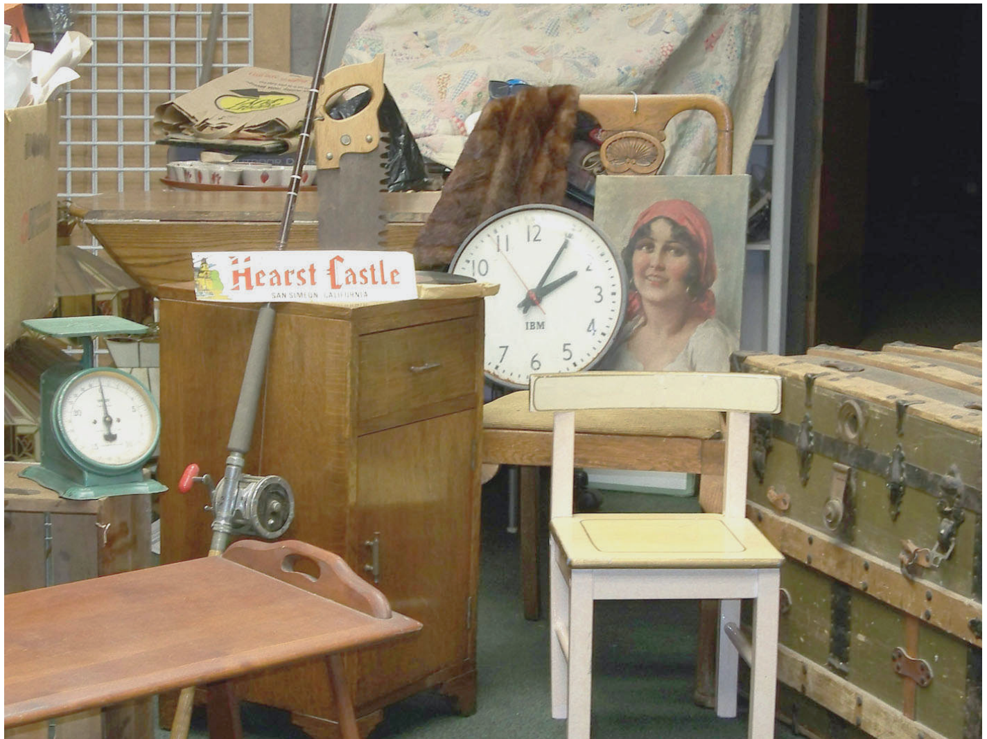
Items waiting for a lucky bidder at the auction